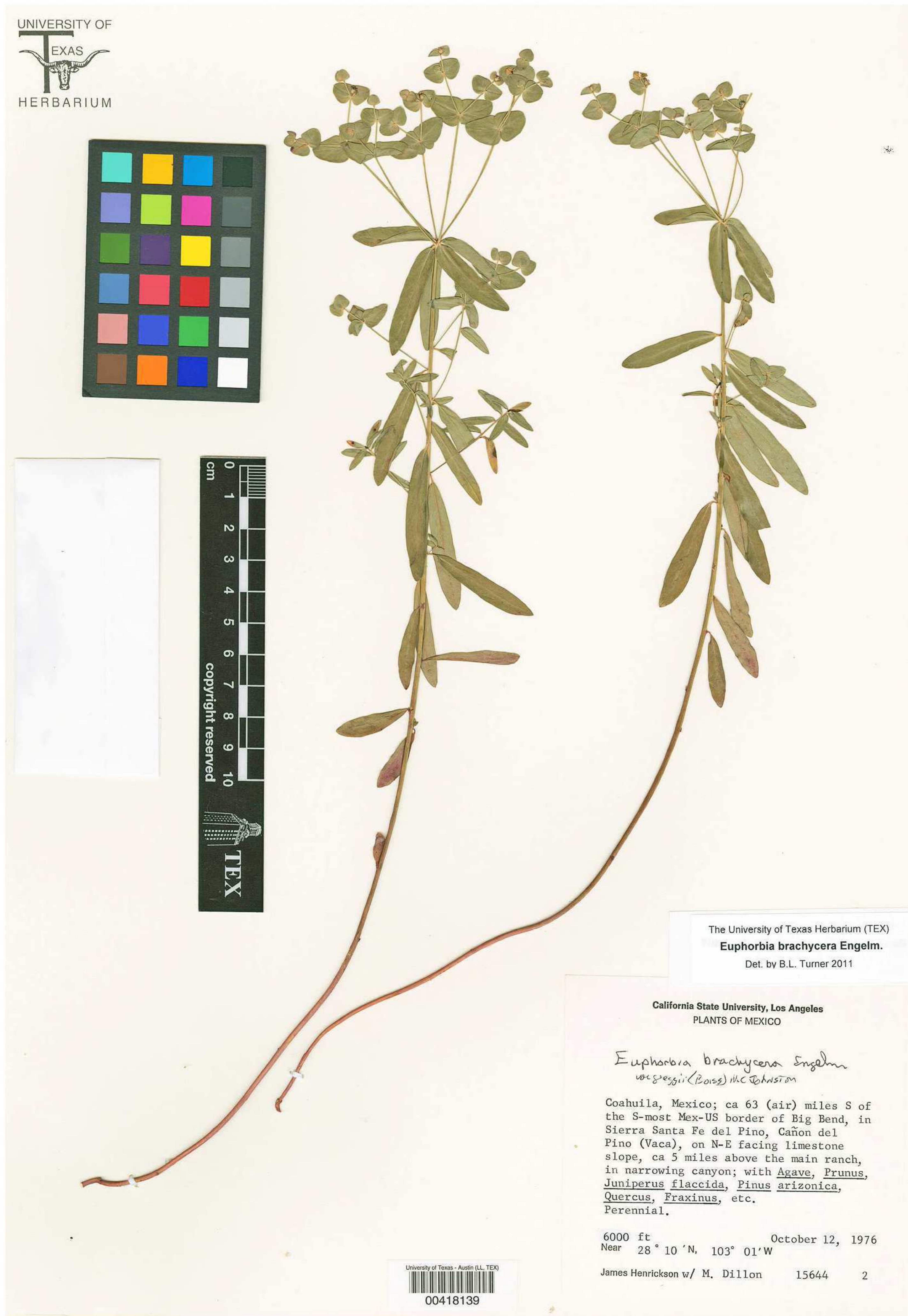
Figure 4. Euphorbia brachycera (growing with E. ivanjohnstonii forma longifolia ).